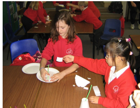
Children enjoying a design challenge from Destination Imagination