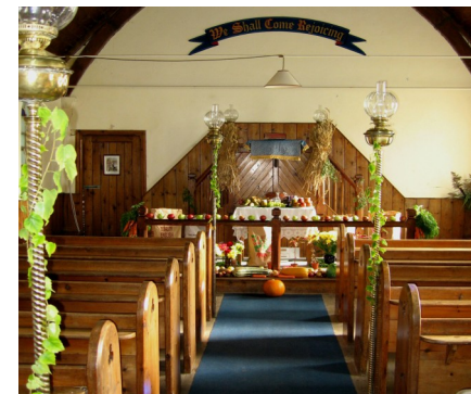
The Chapel decorated and prepared for a recent Harvest Thanksgiving Service.